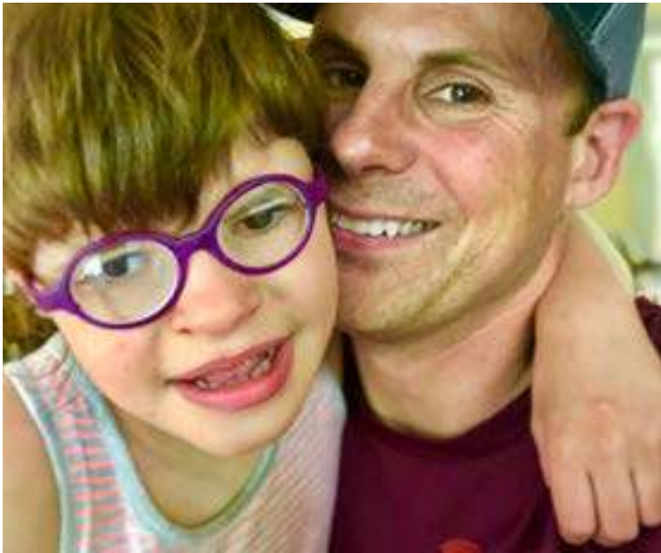
The author with his daughter